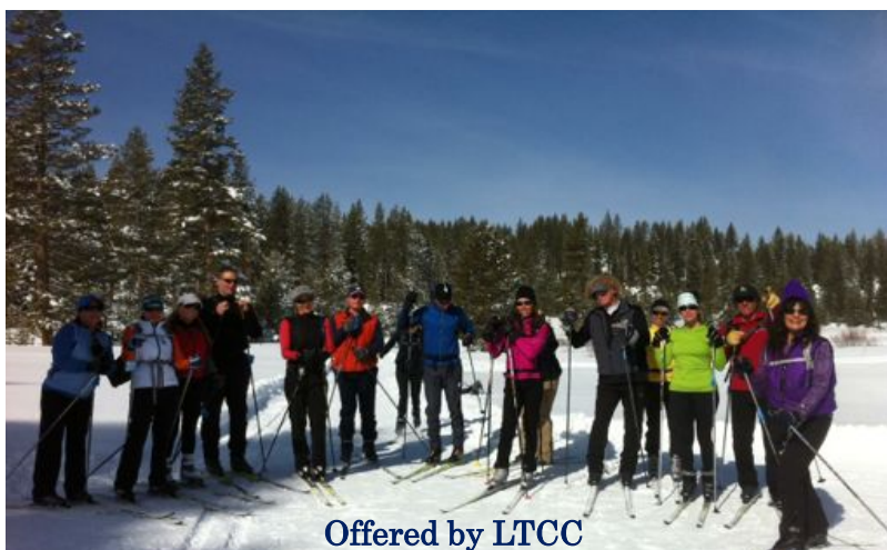
Offered by LTCC

WLD 122C / WLD 122D / WLD 122E Classes begin - Jan. 10 thru Mar. 28 Fridays 9 a.m. to Noon Located at - Tahoe XC Tahoe City's "World Class" XC Resort