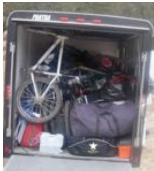
A $3000 donation to the UNR Cycling Team will help keep their gear getting to events

Cross Country Center (209) 258-7248 www.kirkwood.com